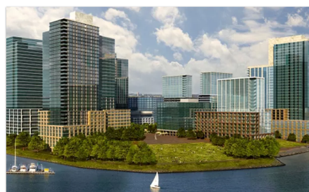
Harbor Point Master Plan Baltimore, MD

Located between Harbor East and historic Fells Point, Harbor Point will be a vibrant, highly integrated neighborhood with a focus on sustainability and innovation. As the City's largest downtown, waterfront site yet to be developed, Harbor Point will be composed of 3 million square feet of mixed-use space on 27 acres and will be the leading development showcasing Baltimore's urban renaissance. The neighborhood will feature thoughtfully designed public space including 9.5 acres of waterfront parks and a promenade along the water's edge.