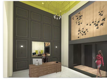
The Latham at 17th Philadelphia, PA

Formerly the Latham Hotel, this unique properties is converted to provide modern apartments, all under 350 sq ft, to the Philadelphia housing market. Each studio at The Latham at 17th is designed to fit a modern lifestyle. The apartment experience includes a full kitchen and dining bar, built-in storage, flat screen TV, plus access to 10,000 sq ft of resort-like amenities right across the street. With a Rittenhouse location, these apartments are right in the center of Philadelphia's dining, shopping and transportation hub.