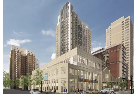
1900 Chestnut Street Philadelphia, PA

1900 Chestnut Street was to be a large mixed use project, with a 30 story residential tower and a full range of retail support spaces at the street. Though the tower development went in a different direction, the large retail shell space is under construction, which will be occupied by a Target Express. With a mix of studios, 1-bedrooms, and 2-bedroom apartments, the tower includes expansive city views and a presence in the Rittenhouse area of center city Philadelphia. Due to the site constraints presented by developer Pearl Properties, the building was forced into a parcel along Sansone Street, rising 30 stories and boasting endless amenities, including a rooftop pool. Additionally, an indoor rock wall and basketball court would be a prized amenity for the active community in Philly. Architectural expressions of the former Boyd Theater would be exposed in the residential lobby space, while mixed with sleek lines and modern design. 80 parking spaces, 2 large retail tenants, and 300+ units would reactivate this block with new life and active tenants.