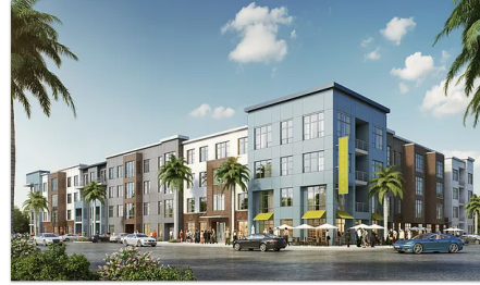
Solstice Orlando, FL