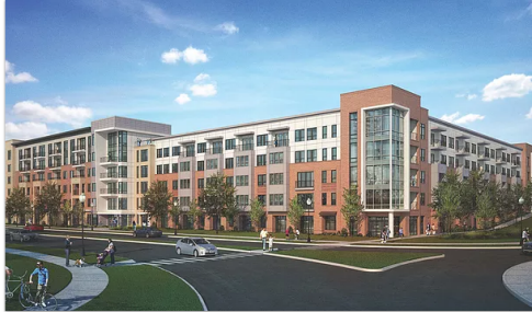
Odenton Town Center Odenton, MD

Located among the rapid development near Ft. Mead in Odenton Maryland, this new project on Town Center Boulevard will be a signature feature to this neighborhood. Featuring 270, well-appointed units with a mix of Studios - 2 bedrooms. Premium amenity spaces will include an active courtyard with pool, fitness center, game rooms, lounges, media lounges, screened poolside cabana, business center and much more. This building will elegantly cater to the renter of today, with a variety of options and perks.