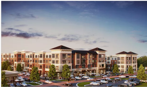
Carraway Village Chapel Hill, NC

A premier community, located in Chapel Hill, near I-40 and providing great access to the Triangle region. This lifestyle destination will offer 400 rental units, ranging from a mix of Studio, 1, 2, and 3 bedroom units - including row house style apartments with private garage parking. The greater community focuses on walkability with plenty of retail, open space, and resident amenities. A spacious clubhouse is a social hub for the site, while the extensive fitness room opens out to the village green, and the expansive pool deck is connected to an onsite spa room.