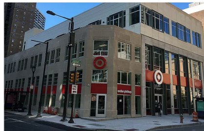
1900 Chestnut Street Retail Philadelphia, PA

This prime Rittenhouse corner, formerly a collection of small buildings of mixed uses, is now becoming a large urban hub for the new Target urban prototype, TargetExpress. The master plan of the site will include a residential tower and other large retail parcels. The retail shell is currently under construction, which will be occupied the ground and 2nd floor of the corner building. TargetExpress stores are described as the retailer's newest and smallest format at approximately 20,000 square feet. It will be a flexible-format concept that more easily fit into a densely populated urban area while catering to them. The store is centered around shoppers who are walking, biking or taking mass transit to the store and not driving a car.