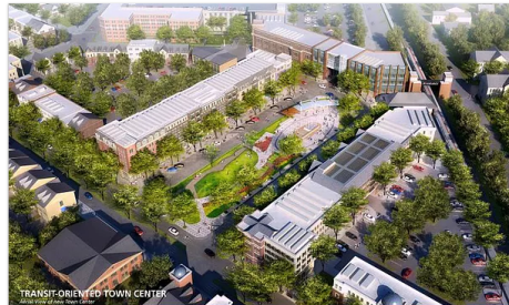
Wyandanch Town Center Wyandanch, Long Island, NY

A multi-phased Transit Orient Development stemming from the long needed master plan at the previously non-existent center of Wyandanch Long Island. In addition to the master plan and phasing / site scheme for the project, the designs and development of the first four (4) apartment buildings were included in the package. The diverse mix of units include rental and condo options, open loft schemes and 3 bedroom duplex offer a unique set of plans to draw people to the new town center.