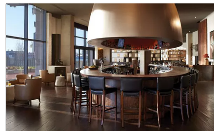
Wit & Wisdom Tavern Four Seasons Hotel Baltimore, MD

This cozy tavern and bar, inspired by the taste creations of Michael Mina as he expands his California brand to the Eastern shores, is food for all senses. Follow the alluring scent of the live-fire grill into the tavern, then linger in the restaurant for delightful views of the waterfront from the dining room, lounge or outdoor patio. Inside, inviting surroundings based on traditional East Coast décor are enhanced by modern touches.